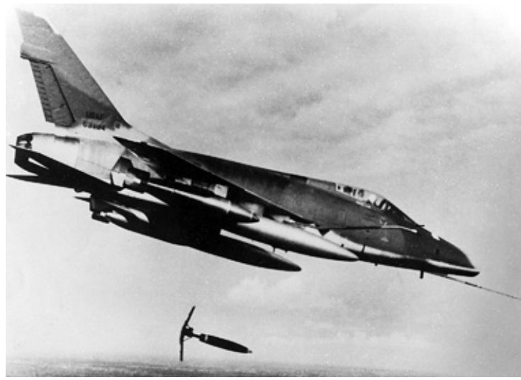
Super Sabre on the attack.